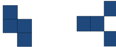
Figure 1: Ways of arranging four squares

Two examples of legitimate arrangement of the four squares can be seen in Figure 1.